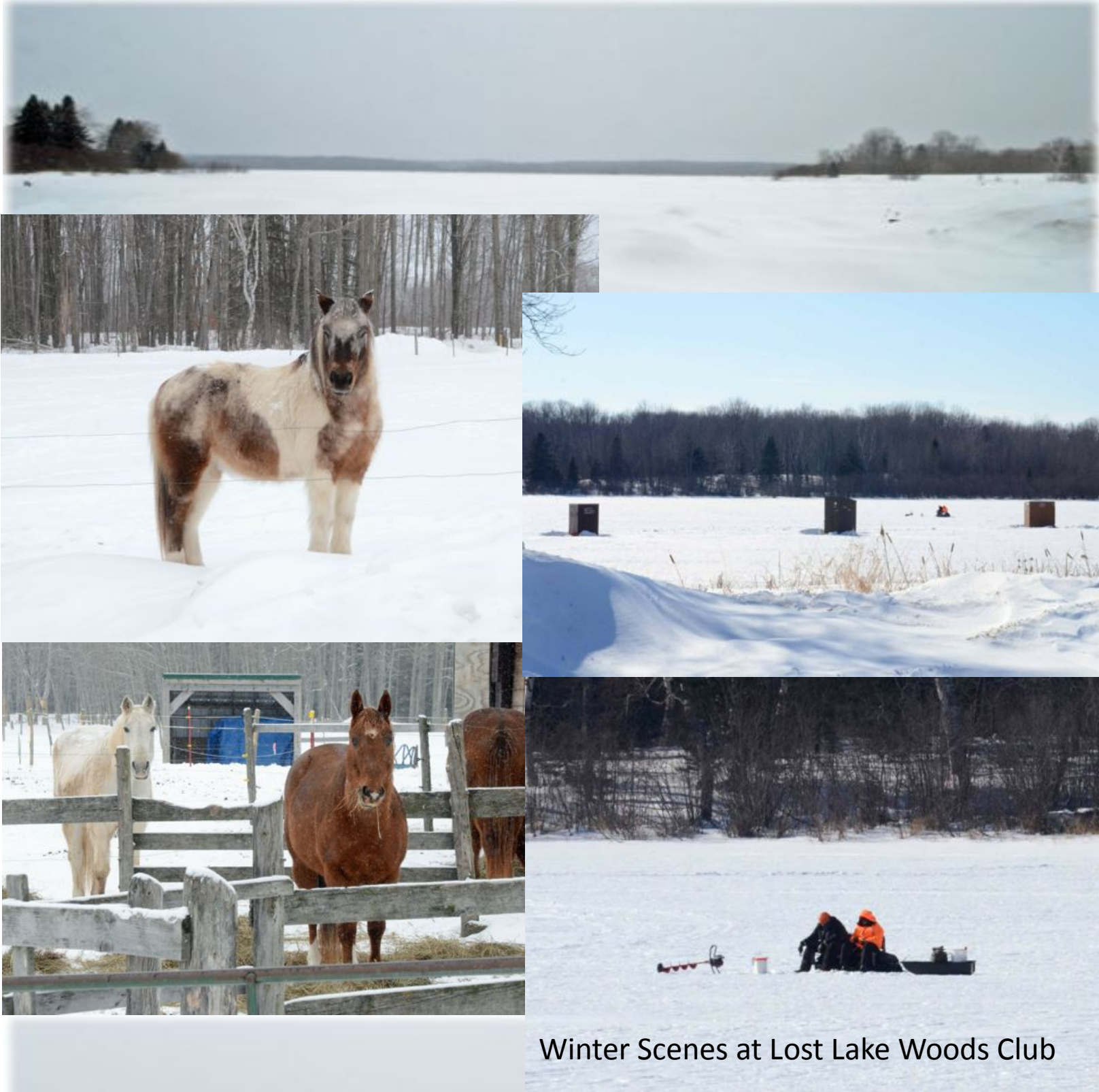
Winter Scenes at Lost Lake Woods Club